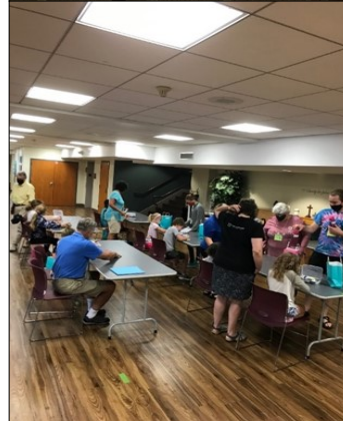
Crafts & Rec time