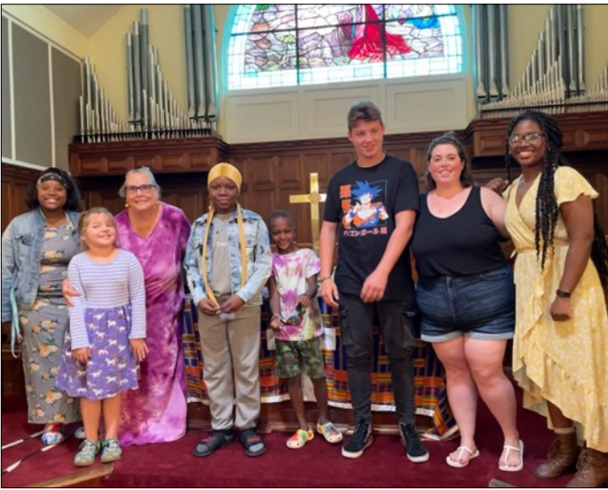
Goodbye to Theo