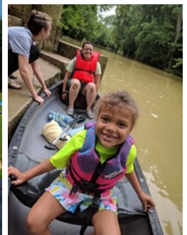
Cedar Ridge pictures