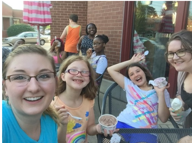
Youth Group Ice Cream Party!