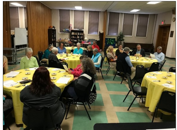
Maundy Thursday 2023