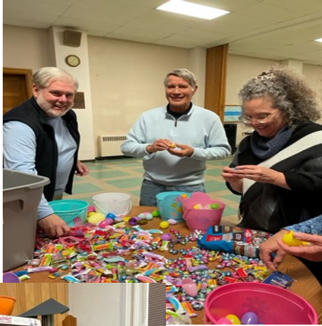
Preparing for the Easter Egg Hunt the day before Easter!