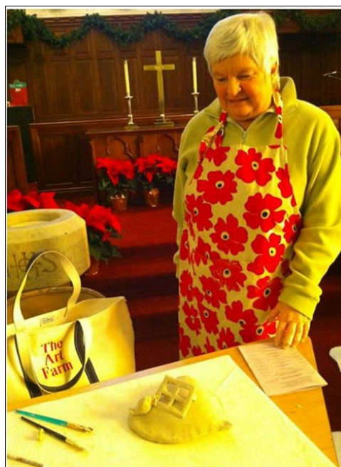
Memory Lane — Finished clay art from the Cantata 2010

BRP FOOD PANTRY : Please give food items to the BRP food pantry as you are able. We always need items to give away to those in need who come to the church door: tuna and chicken lunchables, beanie weenies, peanut butter crackers, cheese crackers, granola bars, etc. All items should be in a single package and not need refrigeration.