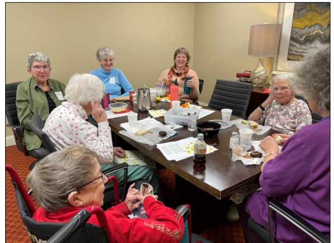
Here is our Circle meeting at Miralea on the Masonic Home campus. We've decided to meet on the 3rd

After church service, February 19, 2023, we will hold the annual meeting of our church. The Session will present the approved 2023 Budget. We will have a time of remembrance for those we have lost this past year. We will lift up some highlights of church committees on their past year of mission and ministry in the church.