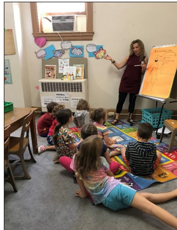
The Louisville Home School , meeting at BRP, continues to provide home schooled children with the opportunity to participate in educational classes, field trips and activities.

The continuing work of the Pastor Nominating Committee. Pastor Mary who is guiding BRP through this period of transition. The Building & Grounds Committee. Doug Rapp has been overseeing the following BRP repairs: Toilet replacement in a basement bathroom; sink repair in both bathrooms on the third floor; painting the bathroom on the first floor after the wall was torn out due to steam pipe repair; repairing steam pipes all over building including 3 in the sub basement.