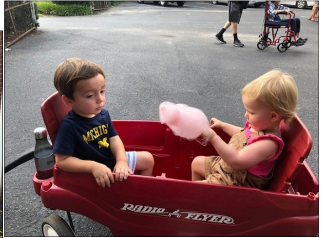
Wagon cotton candy