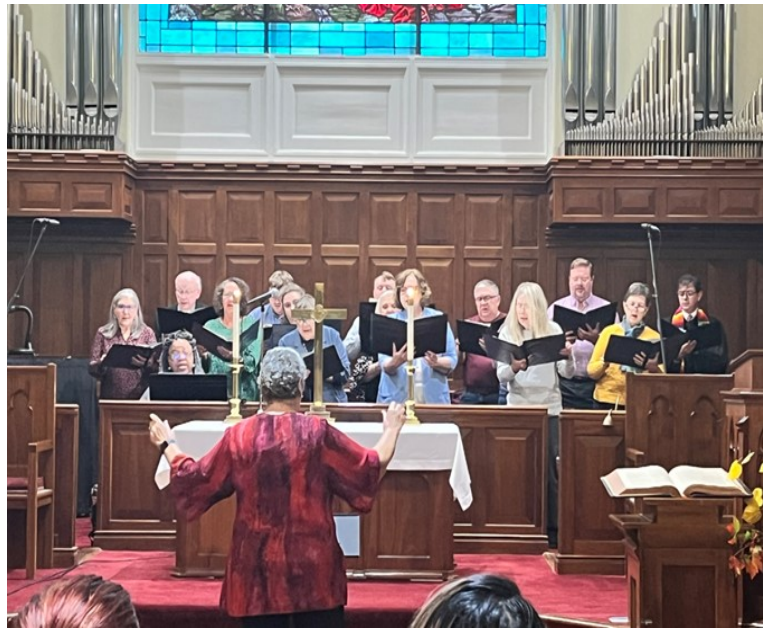
A festive Reformation Sunday at BRPres with guest musicians!