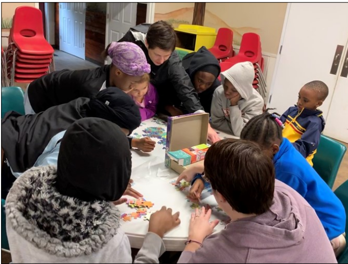
There is always room at the table