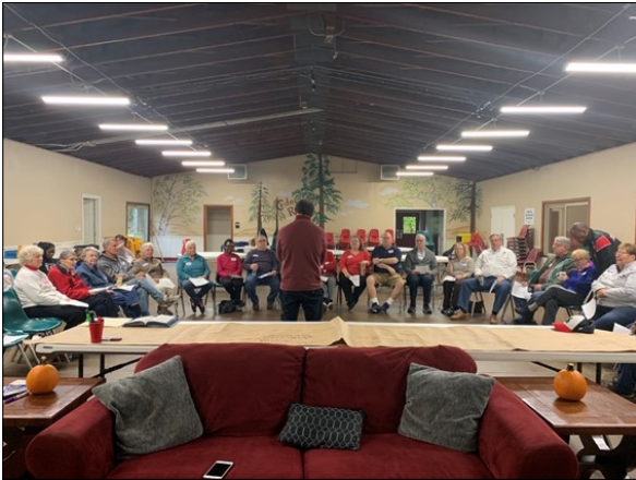
Family Camp shares in Psalm 84

The retreat was on Saturday October 26, 2019 at Cedar Ridge Camp.