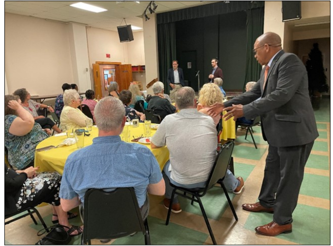
CLOUT Meeting - 2