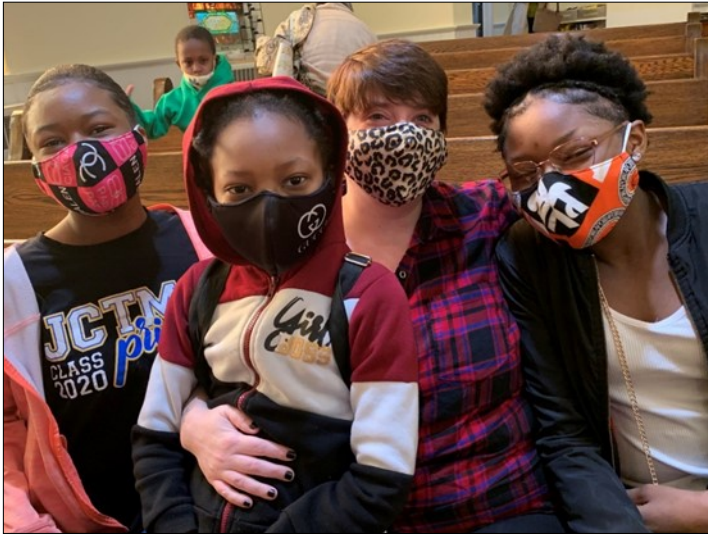
Sunday November 8 2020