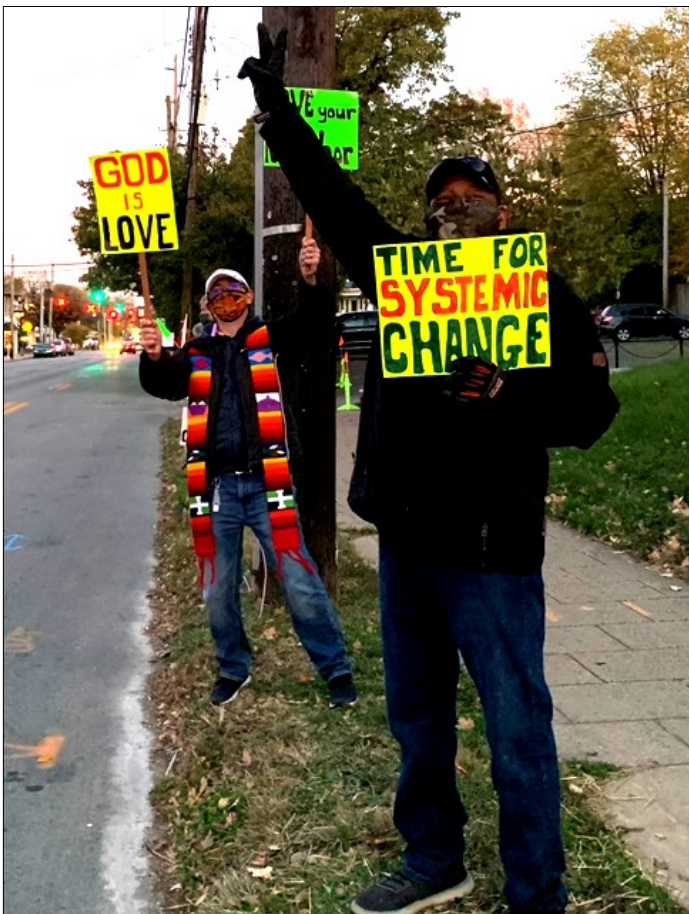
Standing in Solidarity—November 2 2020